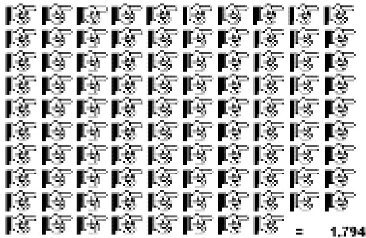
Fig. 1: Racial Breakdown of District Attorneys* in U.S. Death Penalty States